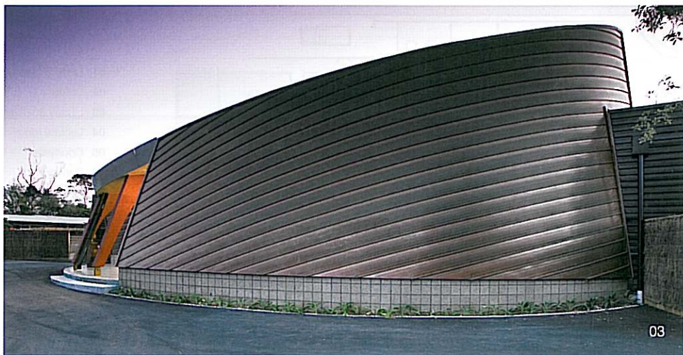
03, 04 Exterior of the NZCCM, showing the cylindrical form of the gallery.

Finally, the relationship between the building's two components remains frustratingly underdeveloped. Programmatically, the NZCCM fascinates because it allows zoo visitors a glimpse into behind-the-scenes veterinary practices. One might therefore consider the interface between public and private to be the most important aspect of the building. Any number of details reinforce this: screens that allow the public to view specimens that are under the microscope in the lab, and cameras placed above the surgery table to record procedures for later viewing. Could there not, therefore, be a greater integration of the public and the private at the scale of the building itself? One can easily imagine the laminated timber portals, the main architectural feature of the public gallery, carrying through to the other half of the building to connect the two components with a strong structural gesture. Krystina Kaza